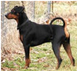
Natural Ears and Tail

COLOR: German Pinschers can be black & tan, shades of red, fawn and rarely blue & tan.